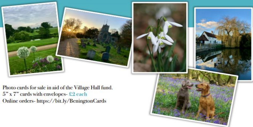
Photo cards for sale in aid of the Village Hall fund.